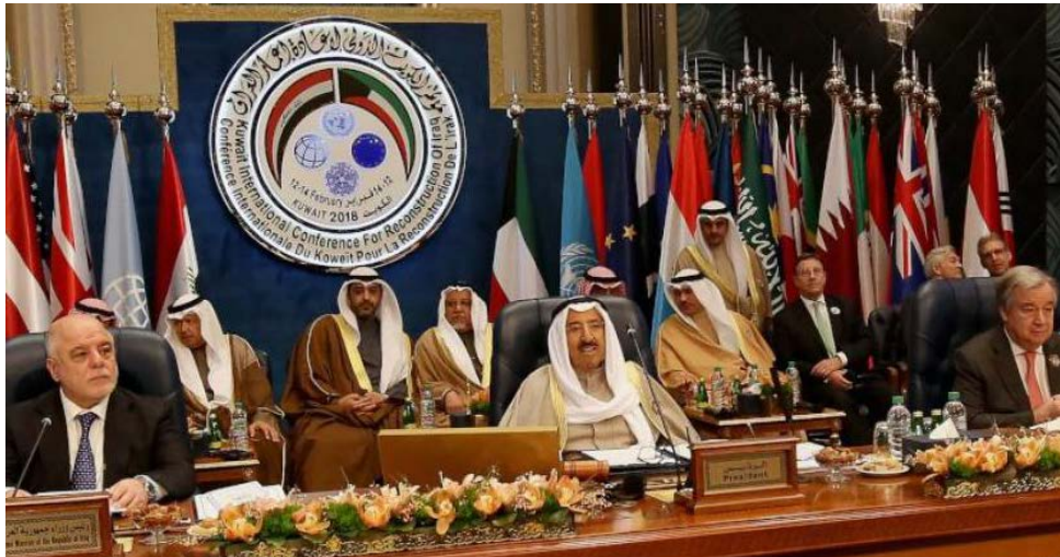
H.E. PM Al Abadi – H.H. Sheikh Al-Sabah – H.E. Mr. Guterres (from left)