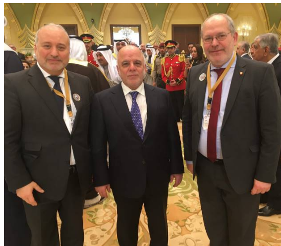
Mr. Khouja – H.E. PM Al Abadi – Mr. Al-Rawi (from left)

The Iraqi government also informed about monitoring measurements for transparency and effective implementation of the projects, such as a special project monitoring platform. This platform, which has been implemented in cooperation with UN institutions, was installed to provide full transparency and traceability of the projects and granted loans by monitoring all aspects of the project, including sponsors, beneficiaries, purposes and effective realization, etc. As another official measurement, the Iraqi government started to transfer competences from the central ministries to the provincial governments, in order to guarantee a direct and efficient implementation of the projects on a local level.